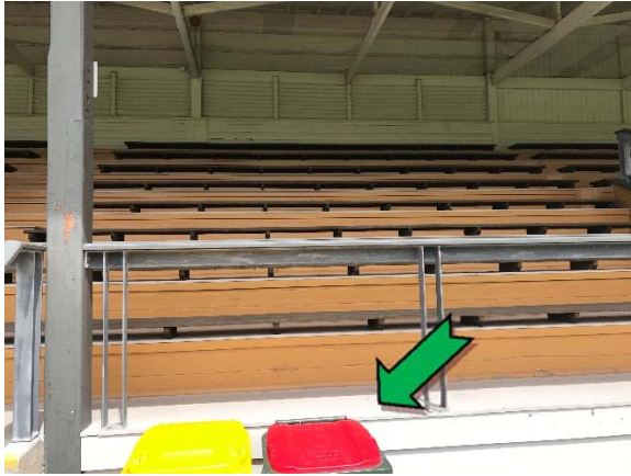
Photo 1. Exterior. Keith Barnes grandstand, floor – non asbestos-containing fibre cement sheeting.